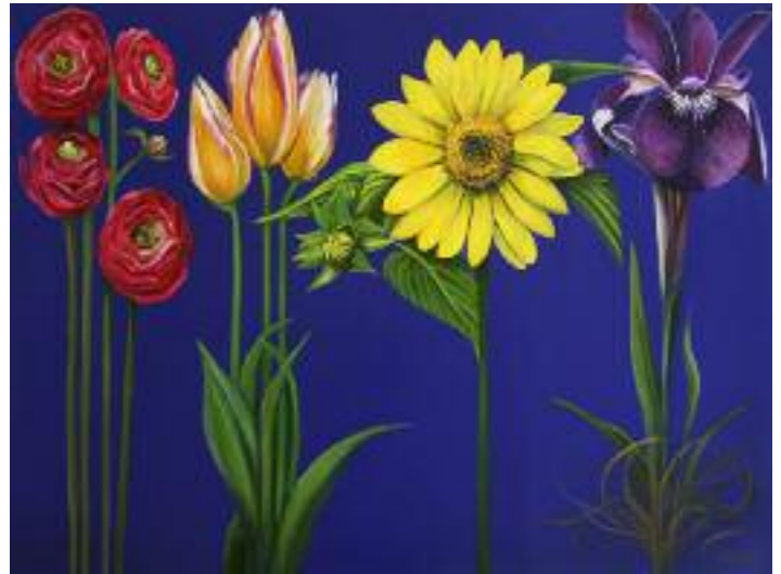
Pia Ledy , Flower Power V , Oil on Canvas, 36" x 48", 2017