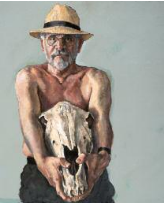
Sigmund Abeles, Self Portrait with Horse's Skull , Oil on panel, 24 x 20 inches, 2001