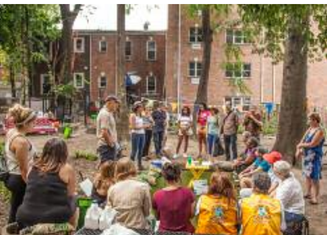
A meeting of the Immigrant Artist Program

Having spent our lives in the artistic community, we have lived through periodic Draconian cuts to the arts. We have seen arts programs have their funding slashed or ended. We have endured government disregard for the value