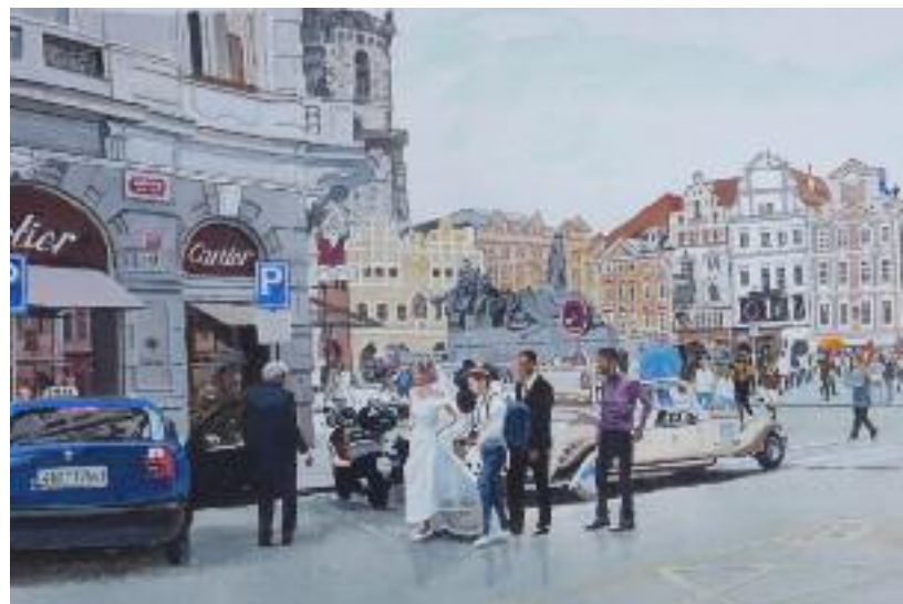
Charles McVicker, Wedding at Prague , Acrylic, 22" x 29"