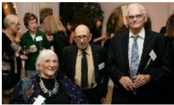
Janet Fish, Philip Pearlstein, Richard Haas