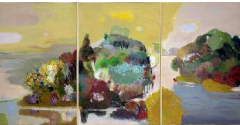
Alberta Cifolelli , Parting Ways , Triptych, Oil on Board, 36" x 72", c.2015