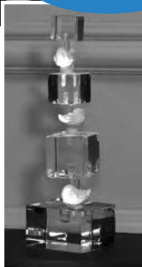
Sculpture by Naomi Campbell