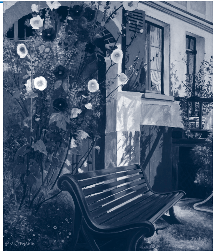
Janet Lippman, Hollyhocke & Green Bench - Giverny, 26" x 21" , silkscreen, private collection