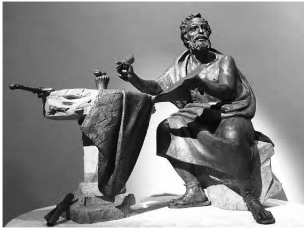
Bruno Lucchesi , Saint Paul Sitting Writing at Table , bronze, lifesize, 2013